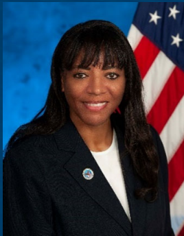
Ellen Shaheed National Training Team - Compliance VBA Education Service, Department of Veterans Affairs